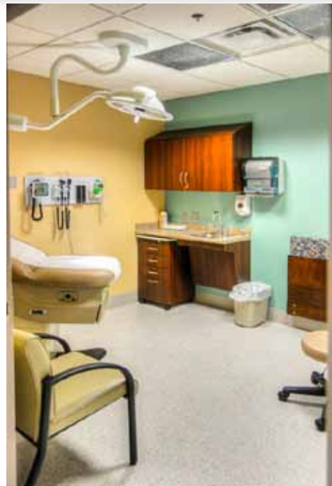
New exam room design located in the new physician office building.

Our newly designed exam rooms are patient and family focused where rooms are larger and equipped with the newest technology available. In addition, the check-in process has also been automated using a self check-in kiosk where a patient can use self identifying numbers that will bring up patient information and make registration a more efficient process.