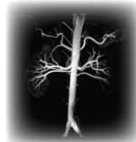
MRI Image without contrast

The new Toshiba Titan Vantage is the newest in the line of Toshiba technology. It has the largest opening for MRI studies, comparable or larger to the size of current CT size type openings. This will allow patients to feel more comfortable during the study. With the new technology, studies will be shortened due to the processing speed. Additionally, as seen below, the non-contrasted studies where dye has been traditionally used can now be done by MRI giving superior images without contrast dye.