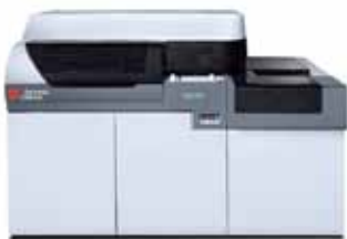
AU680 Chemistry Analyzer

Sweetwater Hospital's laboratory is in the process of upgrading to the most current technology available for blood chemistry analysis. The AU680 system offers a speed of up to 1200 test per hour and on-board capacity of up to 63 different test in parallel.